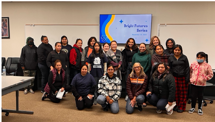
CSM's Strategic Initiatives and Economic Development Department with the Half Moon Bay families who participated in the Bright Futures Series.

College of San Mateo's Strategic Initiatives and Economic Development (SIED) team kicked off a Bright Futures Series in November. Held in Half Moon Bay in partnership with ALAS, Boys and Girls Club, and Cabrillo Education Foundation, the three-part series welcomed nearly 20 Latinx families to gain