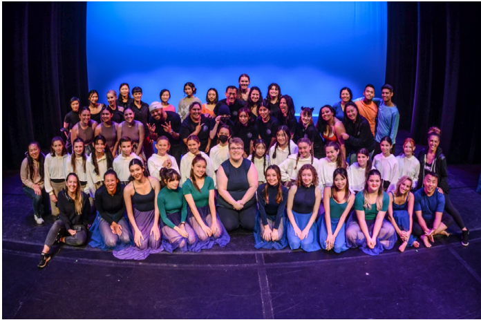
The full cast of Art in Motion.

meaningful way, to have autonomy and responsibility in the marketing of the performance – all of these things and more are such huge confidence-building opportunities.” When we come together from a place of wanting each other to succeed and be the best we can be, we find that every one of us shines brighter.