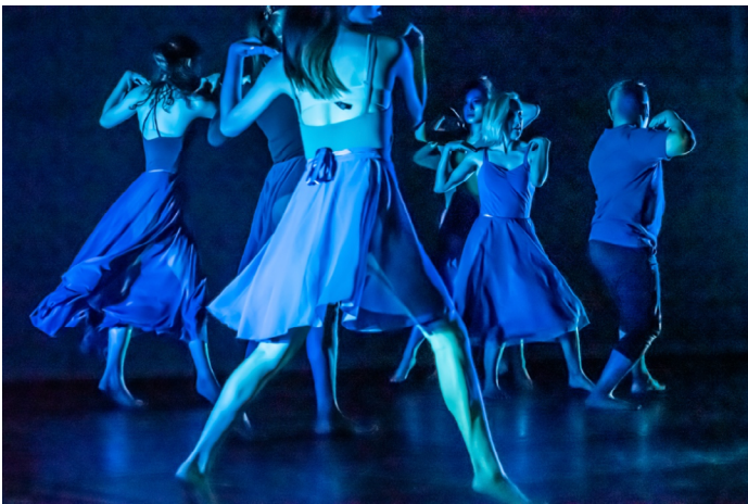
CSM Dance students performing as part of Art in Motion