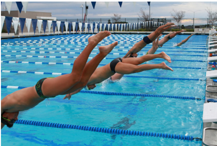
The 2016 men's swim team practicing.