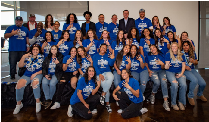
Softball team showing off their championship rings at their ring ceremony.